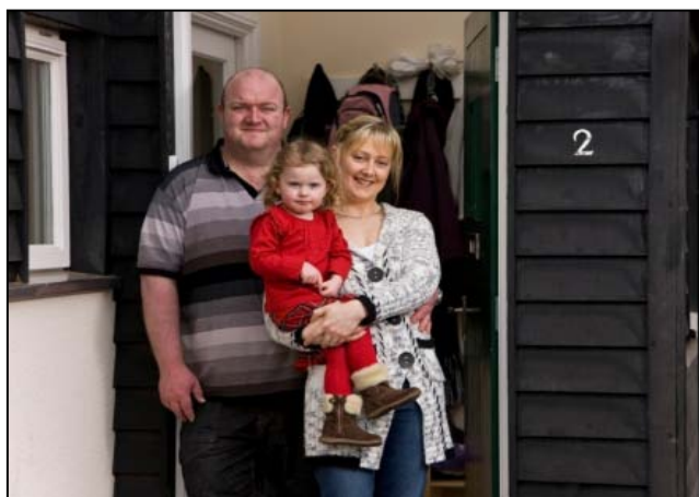
A local family in their new home

"We would talk to the HCA first so that the house design meets their standards from the start. In our case, the trust already had planning consent before we even considered HCA funding. We would also make the roles and responsibilities of the trust and the housing association clearer from the start and particularly during the construction phase. We both made it work, but we were breaking new ground."