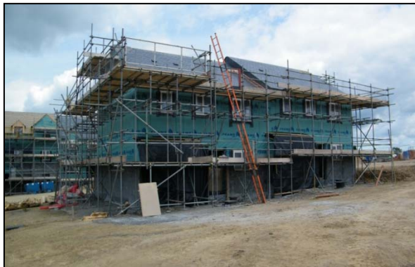
Current work on Little Bickington Farm Development

"Whilst HBCPT has encountered numerous problems and delays along the way we would still want to pursue our original aims and objectives and would almost certainly still start from the point of seeking the views and ideas of local residents and stakeholders. Ideally we would like to be able to put those views and ideas into practice quickly whilst doing it in a way that did not fall foul of existing town planning and governmental policy frameworks! Clearly this will not always be possible but then that is often how existing policy is challenged and brought up to date."