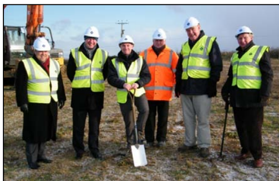
Work starts on site December 2010

Devon county council (DCC) entered into an agreement with the High Bickington Community Property Trust (HBCPT) to redevelop one third of a smallholding by providing 39 new homes and other facilities. The land has been transferred to HBCPT who are engaged in carrying out a 3 phase development over 4 years at a total estimated cost of £12.5m. At completion, HBCPT will account to DCC upon its costs and income and the surplus will be split between both parties. HBCPT will use its share as a dowry to underwrite its social enterprise business, which together with rents, will give HBCPT a revenue stream to meet ongoing management and maintenance costs, and support community development.