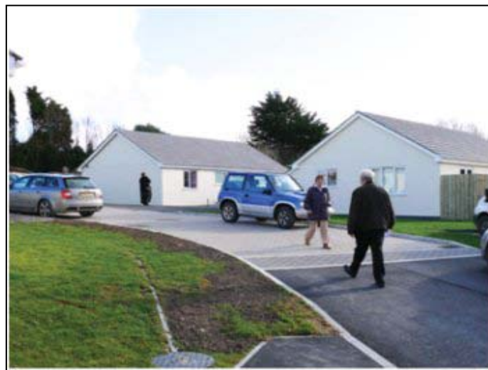
Completed homes at St Minver

"The St. Minver project was powered by NCDC's interest free loan, and the trust has come to believe that the principal enabler would be a system of revolving funds. Availability of such funds would facilitate works to the point of mortgage drawdowns. If central and local government could initiate such provision, the same money would see multiple developments flourish."