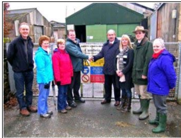
Trustees at the site entrance

“I do not think our group knew what they were letting themselves in for. The process has required serious commitment in time, stamina, and willpower as we have constantly challenged our own thinking and that of government agencies and departments. Along the way, however, we have had brilliant fun, doing a sponsored abseil down the outside of our church tower, quiz nights to raise funds or the community workdays refurbishing our pub, with people of all ages knocking walls down and painting.”