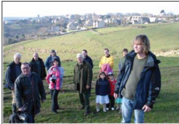
Supporters and potential residents

"Choose your developer carefully. We chose a developer who offered innovative sustainable design that incorporated an element of self build. The original estimate was very competitively priced but the price rose three times resulting in an increase of £400,000. This made the proposition a lot less attractive in terms of cost and the board lost faith in the organisation because it seemed unable to accurately predict its costs. We had twice raised additional funds to meet the revised estimates and finally had to apply for HCA grant to meet the shortfall."