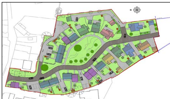
Outline plans on stone works site

Lyvennet Community Trust (LCT) has bought an old stone works site in the Cumbrian village, Crosby Ravensworth which it is currently redeveloping to provide 20 homes for local people. These will be a mix of rental, shared equity and self build plots. The CLT has had the benefit of being in one of the Governments Big Society Vanguard locations.