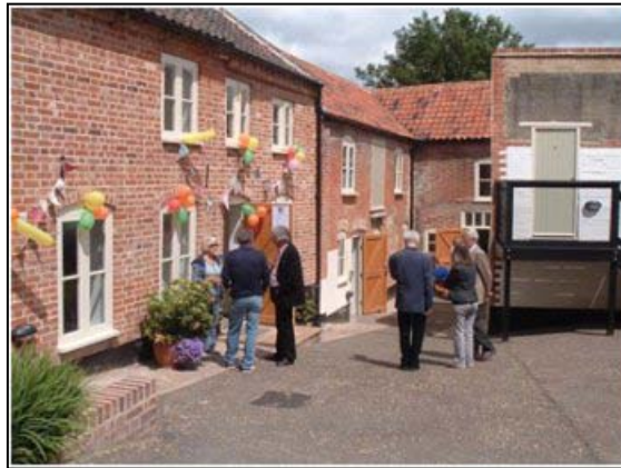
Opening of business units at Miles Court

Foundation East was established as a community finance organisation but its governance structure meets the legal definition of a Community Land Trust. Foundation East is the regional east of England CLT ‘umbrella’ body who acts as a CLT in its own right and kick starts community led projects by providing a temporary ‘asset lock’ until a local CLT has been formed. Its CLT support activities include acting as an independent source of practical support and development expertise.