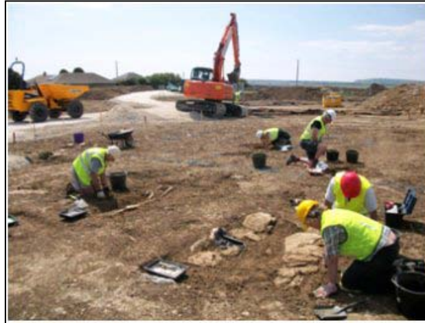
Volunteer archaeologists excavating a graveyard found on the edge of the development

Worth Community Property Trust (WCPT) was set up by local people to benefit the community of the parish of Worth Matravers in Dorset. Its initial objectives included the provision of affordable homes with the first project of 5 homes currently under construction.