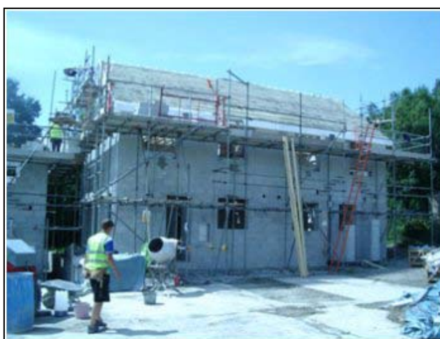
Home at Bridgerule under construction

‘To remain vibrant, our community needs to provide, manage and maintain homes that are affordable to local people. The role of HCPT is to meet this need by supplementing and complementing housing associations by providing for the ‘intermediate market’ through equity share and market rental homes.’