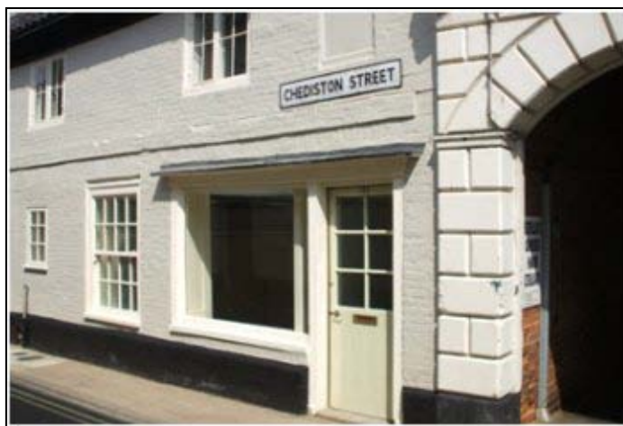
The adjoining building now houses 2 affordable homes and a retail unit

“As an absolute priority, secure funding for a dedicated member of staff over a 5 year period to develop the community assets. This post would specifically carry out the role of a strong and directive client for Foundation East and become self sustainable at the end of that period.”