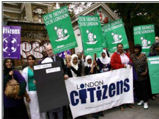
London Citizens campaigning

"If the CLT model is to truly prove itself as a viable and replicable delivery option worthy of the mainstream, then it has to be tested in more diverse communities and it has to be tested at scale. And there is nowhere in the country more suited to this – nor, indeed, more likely to make a success of it – than east London."