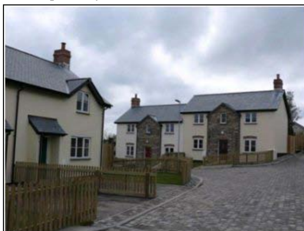
Completed homes for sale at Blisland site

"The board of management is extremely enthusiastic about the prospects and opportunities for CCLT in Cornwall and at a recent board meeting re-affirmed the importance of employing professional development staff and the synergy in sharing costs and expertise between CRHA and CCLT. They felt that this was a 'win-win' situation that others could learn from, particularly they believed that this gave confidence to their funders and local partners especially Cornwall council."