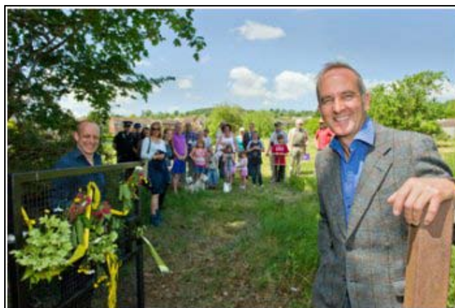
Kevin McCloud from HAB and residents at Cashes Green allotments

Gloucestershire Land for People (GLP) has been exploring the redevelopment of the derelict hospital site at Cashes Green, Stroud. Plans have been submitted to the district council to build 78 homes, of which 20 are for rent, 19 for part ownership and 39 for sale on the open market. Cashes Green Community Land Trust (CGCLT) is being set up (with the support of GLP) to purchase homes as it can afford to and ultimately for the CLT to own and manage all the affordable homes with housing association support.