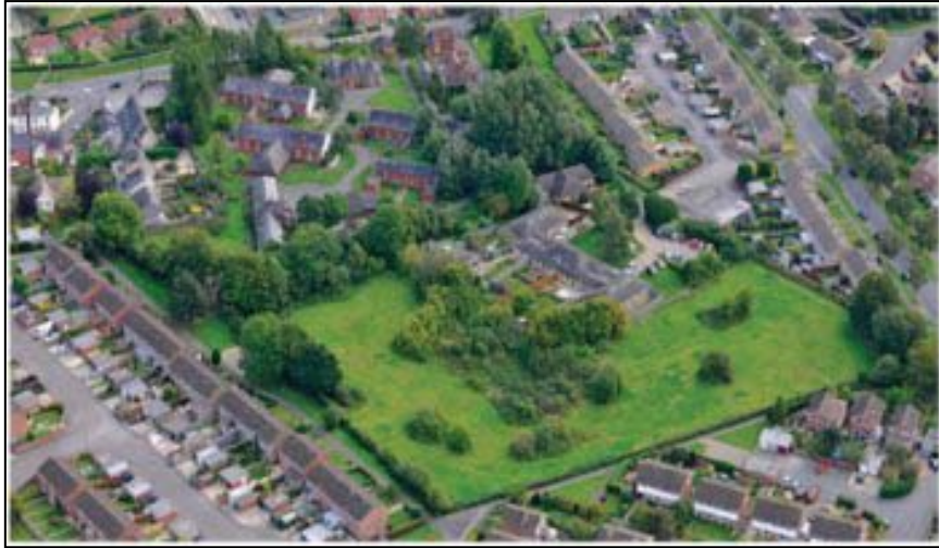
Cashes Green site