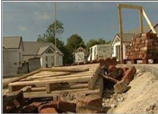
Saint Minver under construction

Rock, in the parish of St Minver Lowlands in North Cornwall is reputedly one of the most expensive places in the world to purchase a home due to high levels of second home ownership and holiday lets. A local group formed a CLT to facilitate the provision of affordable self build homes and in their first scheme completed 12 homes for local people at under a third of open market value. A further phase of homes is underway which will result in the CLT providing a total of 20 homes on a rural exceptions site.