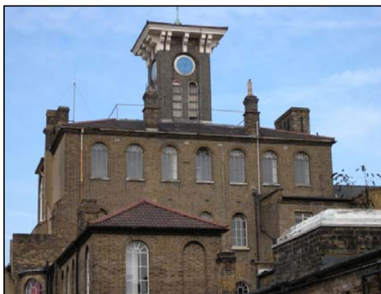
Clock tower of St Clements hospital, Bow

East London Community Land Trust (ELCLT) has been formed to promote local community interest in being involved in community led and owned housing schemes envisaged for the Olympic Park legacy neighbourhoods in East London. ELCLT has also taken the lead in working with existing and emerging community owned and led housing bodies to set up a 'community housing working group' in Tower Hamlets. The CLT's pathfinder project is St Clement's hospital in Bow.