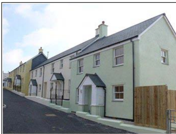
Completed homes for sale at Saint Ewe

Cornwall Community Land Trust (CCLT) is an 'umbrella' CLT which provides practical advice and support to local communities wishing to establish their own local CLTs. CCLT can also bring forward developments in its own right where it has the support of the local community. CCLT has a development programme of 100 homes and is now financially self sufficient after taking a development fee from successful completions and acting as a development agent for Cornwall Rural Housing Association (CRHA).