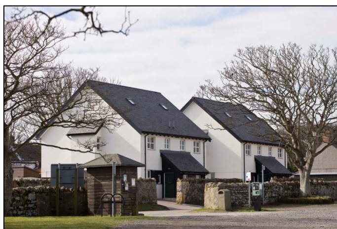
Completed homes on Holy Island

The Holy Island of Lindisfarne Community Development Trust (HILCDT) was formed fourteen years ago to build affordable homes for island residents being priced out of a rising housing market on the island. The trust originally obtained charitable donations to fund the construction of 7 two bedroom houses and flats for rent with all but one of the tenants working on the island. The trust then found the original families needed larger homes and the decision was made to build more homes and a scheme of 4 three bedroom homes was started in May 2009 in a unique partnership with 4 Housing Group. HILCDT was the first CLT scheme to receive an investment from the Homes and Communities Agencies National Affordable Housing Programme.