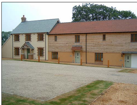
Lydden Meadow completed homes

Buckland Newton Community Property Trust was formed by local people to provide affordable homes for people with close connections with the village through residency, family or work. An initial development of 10 homes has recently been completed. The support of West Dorset district council was instrumental in ensuring the scheme was implemented and the council has also provided a long term loan for the rental homes.