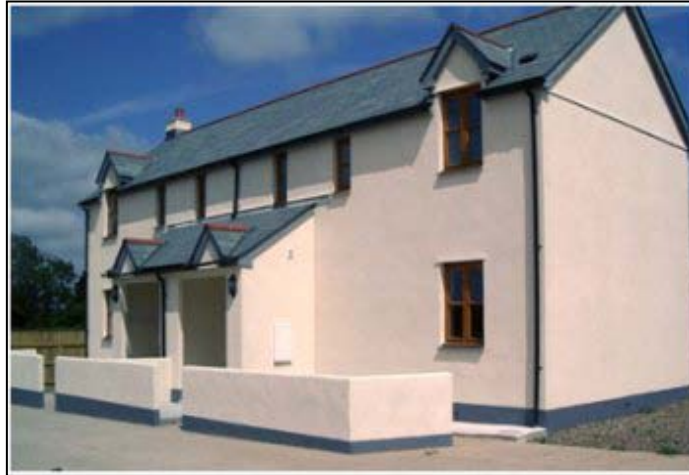
Completed homes at Sheepwash

Holsworthy Community Property Trust (HCPT) has been established as a charity to provide affordable housing in the rural community of Holsworthy, North Devon. The trust aims to provide 50 homes for local people who are unable to purchase a property on the open market.