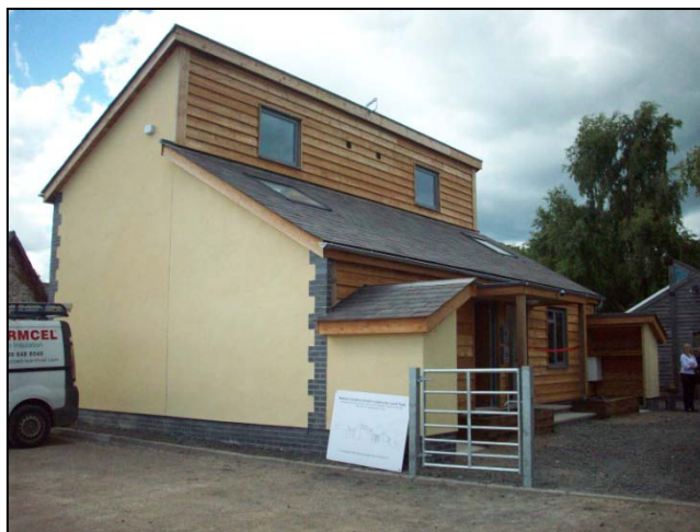
'Kings Head' development

The Bishops Castle and District Community Land Trust (BCCLT) was created through the hard work of local volunteers to provide affordable homes for local people, allotments, and premises for small businesses. The first scheme of two rental homes was completed in June 2011 and was financed by a creative funding cocktail, including significant sums from the shareholders of the CLT.