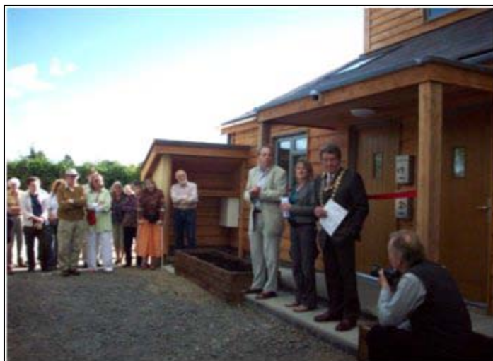
Official opening of the 'Kings Head' development

hindsight we were a bit too cautious and slow, and then when we did get going on our first project, we underestimated the time that legal matters take to get resolved, Also do not underestimate the nitty gritty problems and paperwork incurred when dealing with your providers of water and electricity!”